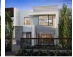
RAVELLO 29 LOT 233