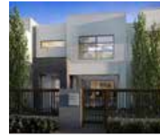
RAVELLO 29 LOT 232