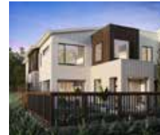
TORRANCE 27E LOT 236