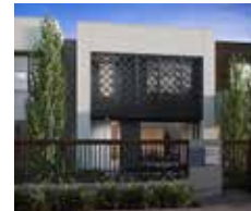
RAVELLO 29 LOT 230