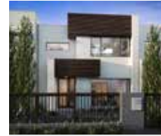
RAVELLO 29 LOT 234