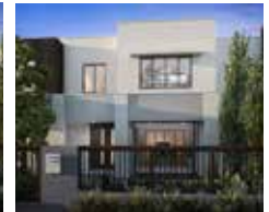
RAVELLO 29 LOT 235