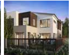
TORRANCE 27E LOT 229