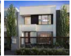
RAVELLO 29 LOT 231